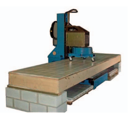
Figure 3a. Universal Floor Tester Full-Scale Assembly

Development of the Universal Floor Tester began in the year 2000. The primary objective was to design a fully-automated testing machine that could be used to evaluate ceramic tile assembly performance using a variety of methods. The primary feature is a weighted three-wheeled carriage, similar to the Robinson-Type Tester, which is mounted on a vertical slide instead of a center axle, eliminating the need to cut a hole in the test specimen. The vertical slide mount also allows for increased clearance below the carriage, up to approximately 40" (1 m), making it possible to evaluate ceramic tile assembly performance under loading over full-scale wood-framed flooring systems (see Figure 3a).