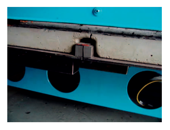
Figure 3b. Universal Floor Tester Sliding Table Mechanism

The tester also features a sliding table mechanism that is used to split concrete pads and simulate crack formation, opening, and closing below ceramic tile assemblies (see Figure 3b). The mechanism can be opened to a maximum width of 3/8" (9 mm), with the rate of opening and closing programmed into the tester by the operator.