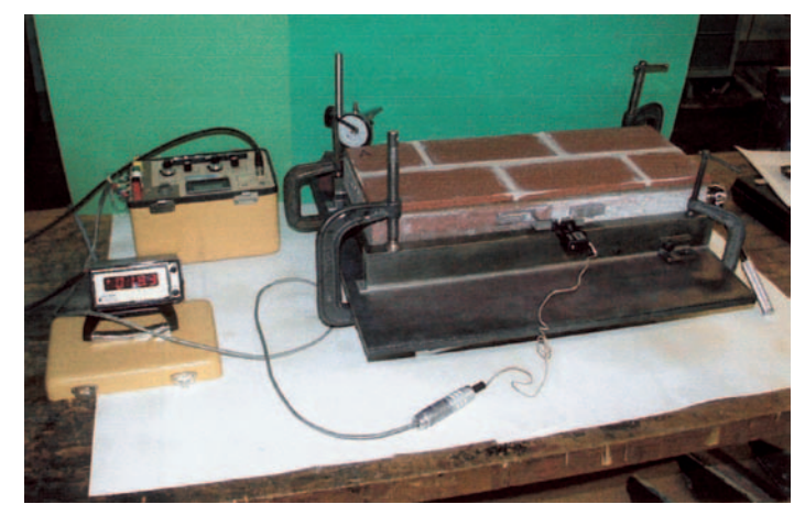
Figure 2. System Crack Resistance Tester

Resistance Test Method uses a specially designed jig, which consists of a steel apparatus to which two concrete blocks are attached: one to a fixed plate, the other to a movable plate. The ceramic tile assembly is installed over the concrete blocks.