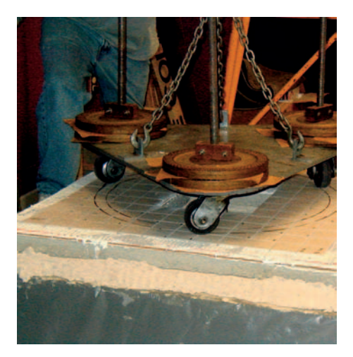
Figure 1. Robinson-Type Floor Tester

The advent of dry-set mortar and subsequent introduction of the thin-set method for tile installation led the Tile Council of America (TCA) Research Center to develop a ceramic tile floor system performance testing apparatus. In 1958, the late Donald Robinson, who was head of the engineering and research department of the TCA at the time, designed a testing machine that was to be used to evaluate the effects of loading, impact, wear, and vibration on ceramic tile assemblies. The tester features a wheeled carriage that is cycled by a center-mounted axle over the flooring assembly with three gravity loads applied 120-degrees apart. The flooring test assembly is restricted to 4 ft x 4 ft (1.2 m x 1.2 m) in size, and must be supported on a central pad. The loaded carriage is applied for a specified number of rotations and the specimen is inspected for damage at the end of the cycle. Depending upon the amount of damage recorded, either the test is ended, or a new cycle of loading begins. A performance rating, ranging from residential to extra heavy commercial, is determined at the end of the test, depending upon the number of cycles successfully completed.