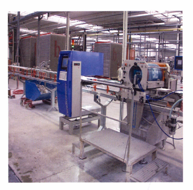
Figure 3. A screen printer is monitored for defects in the decoration pattern

It is well known that the decoration process is responsible for almost half of all the defects occurring in tile production. Tiles decorated either by a flat or cylindrical screen printer can show a large variety of defects such as misregistration of the printed image with regard to the tile edges, small to large glaze spots due to broken screens, glaze stripes due to local screen obstruction etc... We have integrated the powerful colour camera technology of our tile sorter into a low-cost vision system which is placed immediately after one or several screen printers and which checks the printed image with a high-resolution colour scanning of the aniline dyes used to make the otherwise invisible glazes noticeable to the eye of the human operator. The system works on repetitive patterns using our fuzzy image comparison technology and on random decorations using colour texture statistics (figure 3).