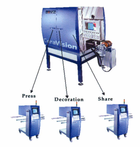
Figure 1. A family of small and low-cost before the-kiln inspection systems have been derived from the automatic tile sorter

Based on our modular multisensorial CeraVision® inspection and sorter, we have designed a family of small, identical looking, low-cost and highly profitable bi-valent camera-based systems to monitor the tile production before the kiln and to eject bad tiles before they continue to consume precious production capacity (figure 1).