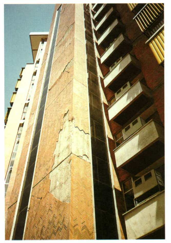
Figure 2. General failure of ceramic tile façade. Extruded stoneware were used with an ordinary mortar. Weather conditions during summer are very severe. Temperature above 40°C is usual. Control joints were built after the bond had failed.

Besides all those requirements there are others that can be taken into consideriation depending on the particularities of the case. Sanitary, hygienic and security can be considered important features.