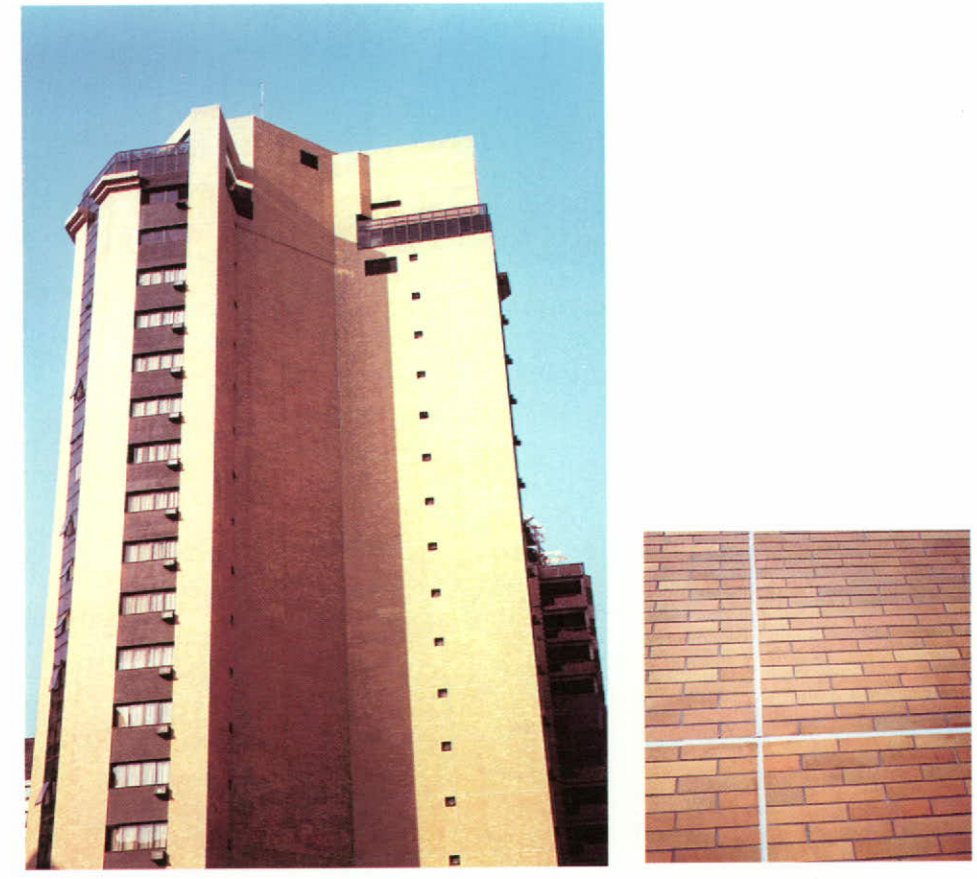
Figure 4. Façade of a building where ceramic tile design has been used with success. Detail shows vertical and horizontal control joints.

This study may also conclude that ceramic tile systems should necessarily involve production technology and product design. Systems should facilitate selection of materials and construction techniques and methods in order to improve results.